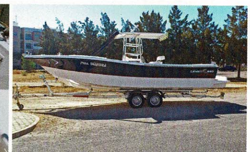
This would make a mean bass boat!

pleasure of going to sea on this model, but if the smaller 770 and 560 hulls are anything to go by, then I'm in no doubt that this boat is going to be a sure fire winner over here in the UK.