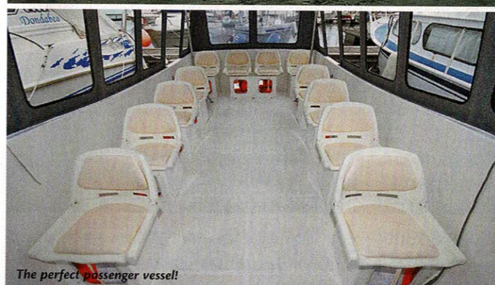
The perfect passenger vessel!