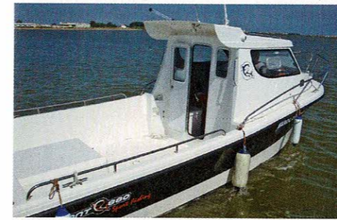
There's plenty of fishing room here.