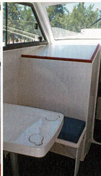
There's seating inside the wheelhouse too.