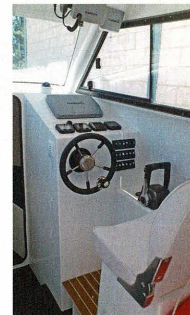
The helm is compact and very functional.

For more details on the 880 and other boats in the Levant range, visit: www.levantboats.wix.com/levant-eng Tel: (+351) 281 543 250 E-mail: tomorrowset.levant@gmail.com or geral@levantboats.com